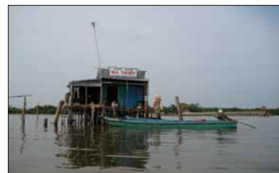
Seafood merchant business and residence, Ca Mau Province, Vietnam, 2011.

I recently returned from a research trip to Southeast Asia where I was blatantly out of my element visiting cobra farms and negotiating the consumption of still beating snake hearts. The object of the research, determined and funded by the University of Miami's Abess Center for Ecosystem Science and Policy, was to identify the vectors of trade for certain venomous snake species within Vietnam. This was a relatively straightforward task, and the interdisciplinary research team made a valiant effort to accomplish it, yet I am left more curious about the nuts and bolts of the collaboration involved than the results of the project itself.